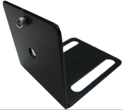
4 Position End Bracket