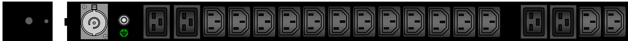
4 Position End Bracket Location Pip & M5 Screw Fixing. Each End

Provided with with 3 metre lead 3x4.0mm 2 HO7 Cable Neutrik 32Amp to IEC309 32Amp Commando Part Number IPL-PL32/3. Other lengths and terminations are available.